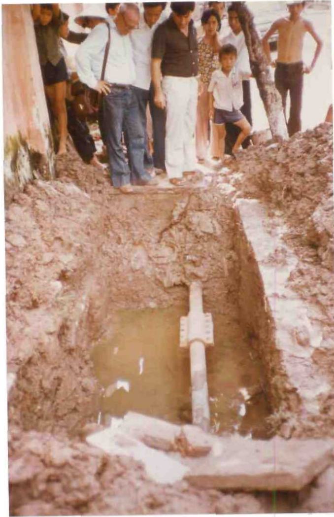
UN JOINT AU CIMENT (p7)